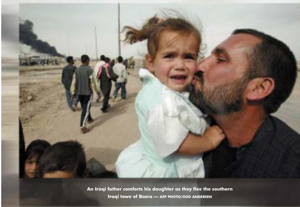
An Iraqi father comforts his daughter as they flee the southern Iraqi town of Basra