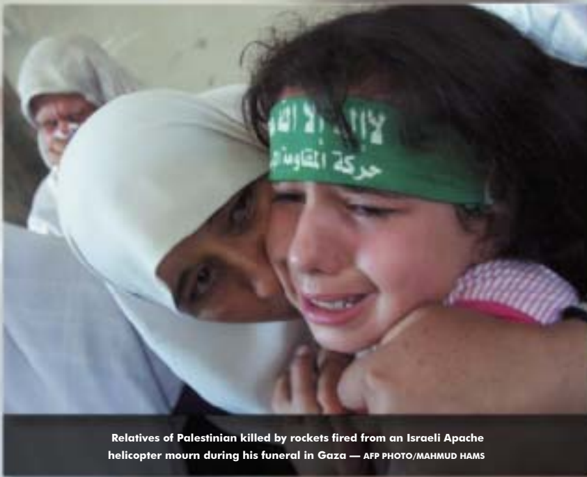
Relatives of Palestinian killed by rockets fired from an Israeli Apache helicopter mourn during his funeral in Gaza