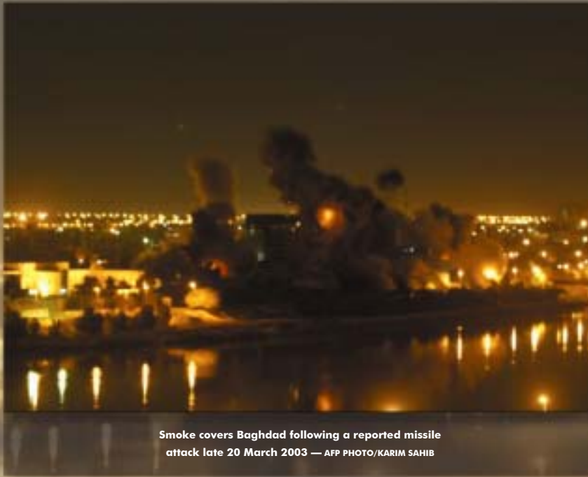
Smoke covers Baghdad following a reported missile attack late 20 March 2003

THE WISDOM FUND advances social justice by presenting the truth about Islam, and alternative perspectives on the news.