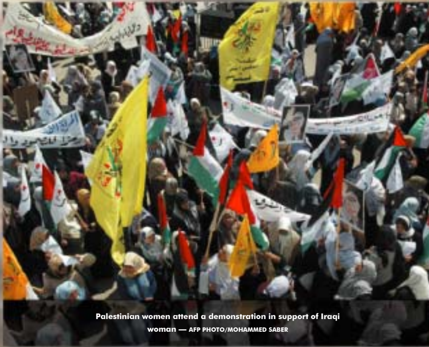
Palestinian women attend a demonstration in support of Iraqi woman

A Community Service of The Wisdom Fund — www.twf.org