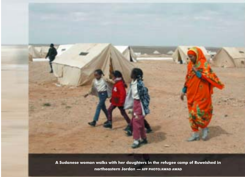
A Sudanese woman walks with her daughters in the refugee camp of Ruweished in northeastern Jordan