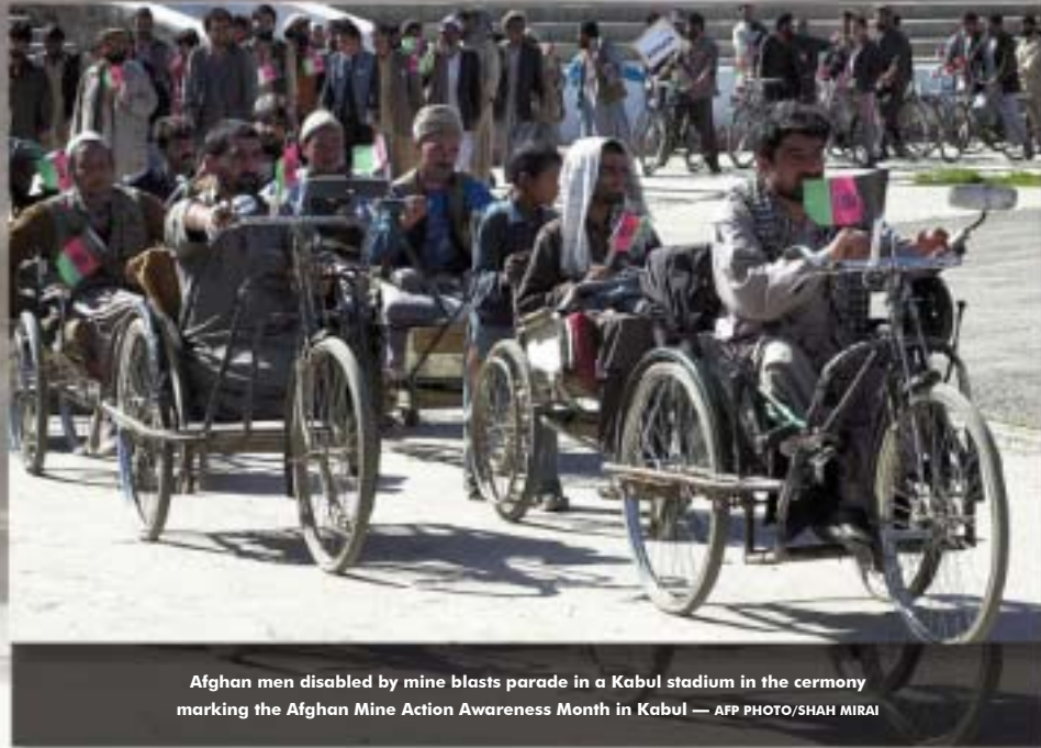
Afghan men disabled by mine blasts parade in a Kabul stadium in the ceremony marking the Afghan Mine Action Awareness Month in Kabul