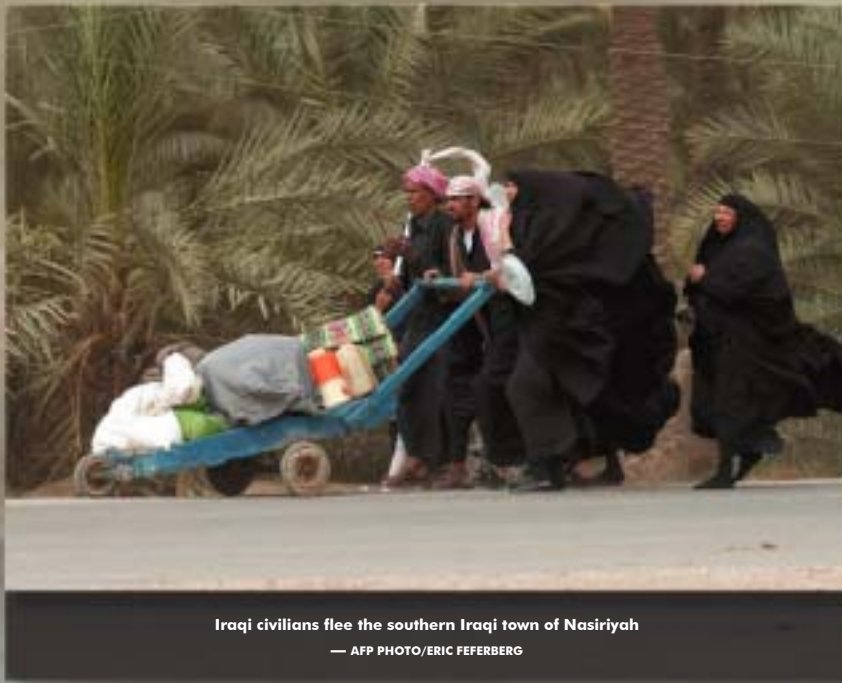
Iraqi civilians flee the southern Iraqi town of Nasiriyah

A Community Service of The Wisdom Fund — www.twf.org