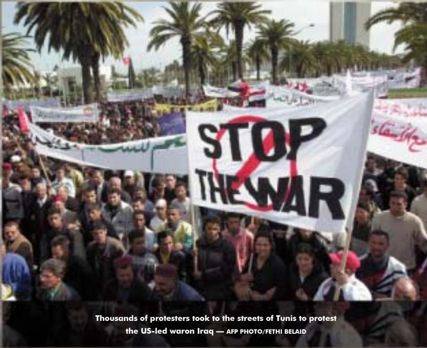
Thousands of protesters took to the streets of Tunis to protest the US-led war on Iraq

THE WISDOM FUND advances social justice by presenting the truth about Islam, and alternative perspectives on the news.