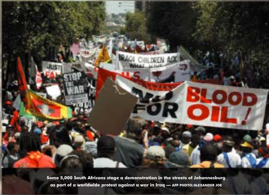
Some 5,000 South Africans stage a demonstration in the streets of Johannesburg as part of a worldwide protest against a war in Iraq

THE WISDOM FUND advances social justice by presenting the truth about Islam, and alternative perspectives on the news.