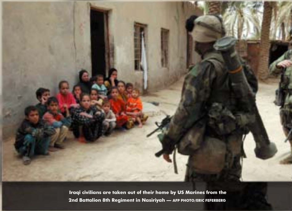
Iraqi civilians are taken out of their home by US Marines from the 2nd Battalion 8th Regiment in Nasiriyah