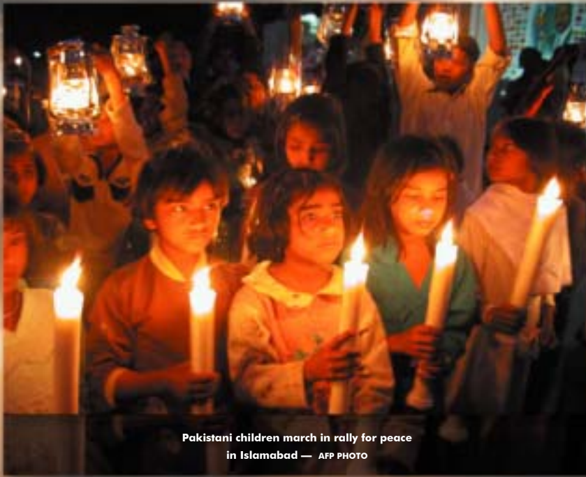
Pakistani children march in rally for peace in Islamabad

A Community Service of The Wisdom Fund — www.twf.org